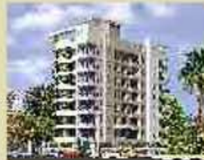
Shree Shiv Shakti